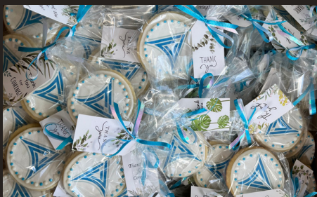
SWEET DELIGHTS AT BBQ EVENT

Success is not the key to happiness. Happiness is the key to success. If you love what you are doing, you will be successful.